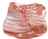
SQUARE CUT SHOULDER 4990