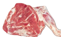
SHOULDER - OYSTER CUT 4980