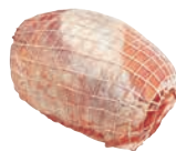
SHOULDER - SQUARE CUT (Rolled/Netted) 5050