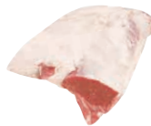
RACK CAP OFF 4748