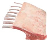
RACK CAP ON Frenched 4756